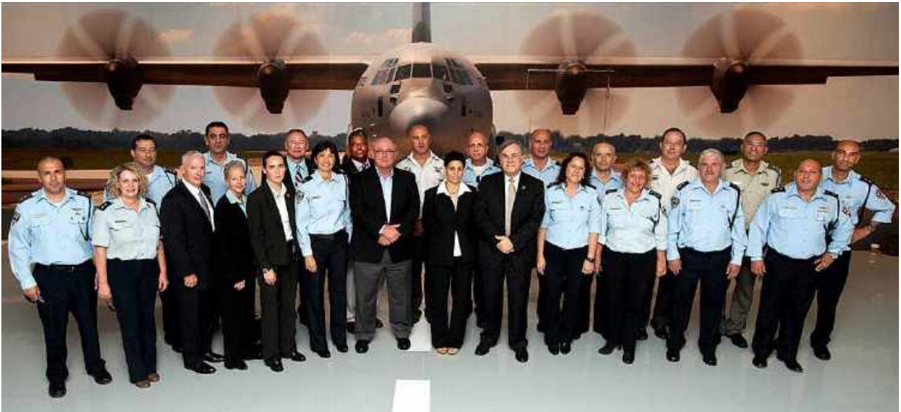
Police officials posing in front of military plane at GILEE meeting in Israel, October 2012

By allowing police officials to train with governments that violate human rights, Georgia is running a serious risk that our officers will learn dangerous policing methods, bring those methods back home, and apply them to the residents of Georgia.