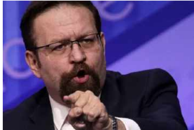
Sebastian Gorka, former Deputy Assistant to Donald Trump

GILEE partners with foreign organizations that promote anti-Muslim bigotry under the guise of countering terrorism. [47] For example, a GILEE partner, the International Counter-Terrorism Academic Community (ICTAC), includes members such as Sebastian Gorka, [48] the anti-Muslim activist, former Breitbart writer, and Fox News contributor who left the Trump Administration months after allegations surfaced that he had supported an anti-Semitic militia and a Nazi-allied group in his native Hungary. [49][50][51] To Gorka, terrorism is rooted in Islam and the "martial parts" of the Quran that he says inspire some Muslims to commit terrorism. [52]