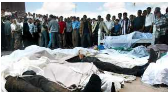
Aftermath of 2005 police massacre in Uzbekistan.

For example, Egyptian police officers have arrested activists, tortured dissidents, performed "virginity tests" on detained women, [13] conducted rectal "examinations" on men arrested for waving rainbow flags, [14] and crushed protests, including a 2013 assault on a sit-in that killed over 800 Egyptians. [15]