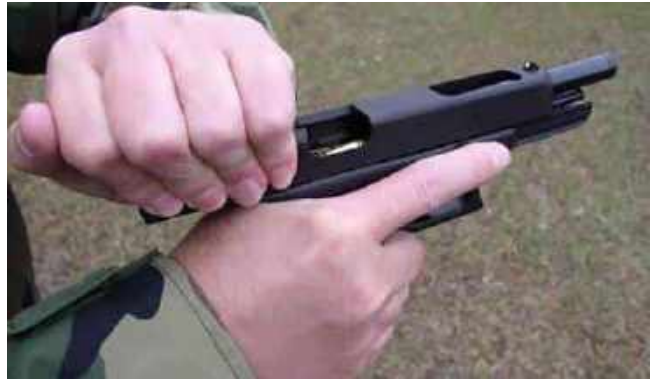
"Racking", pictured above, is a fear tactic taught by GILEE

Among other things, GILEE has taught that officers should inspire fear by “racking” their firearms when they unholster them, which is a common tactic that Israeli officers use against unarmed Palestinian protesters. [9] GILEE also encourages police officials to direct their officers to flash the blue lights on the roof of their vehicles while patrolling certain neighborhoods. [10]