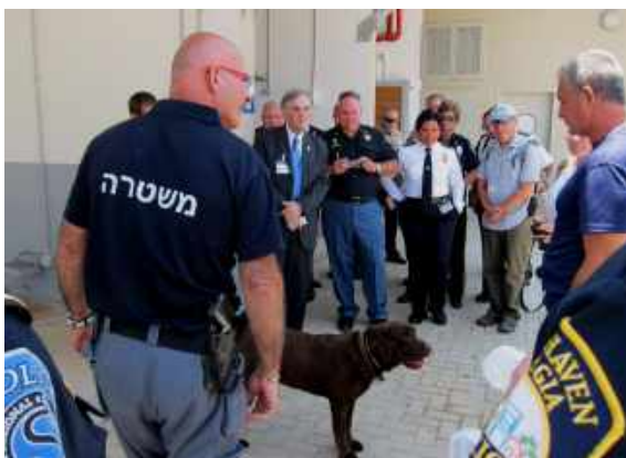
Georgia police officials engaging in training with armed Israeli police.

China runs a massive surveillance state that restricts the civil liberties of its citizens. Protesting is forbidden. So is voting. Activists are subject to arrest. [23] Police have raided “unsanctioned” churches, destroying crosses and burning Bibles. [24] One million Uighur Muslims sit in Chinese concentration camps. [25]