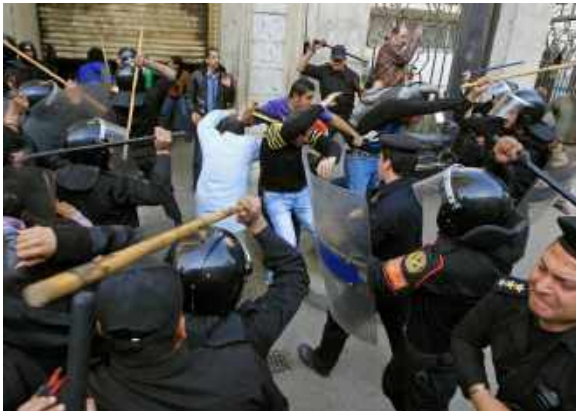
Egyptian riot police attacking protesters, 2011

GILEE publicly advertises partnerships with foreign governments which use their law enforcement agencies to restrict civil liberties, commit human rights violations, and/or promote bigotry, including sexism, anti-Semitism, and Islamophobia.