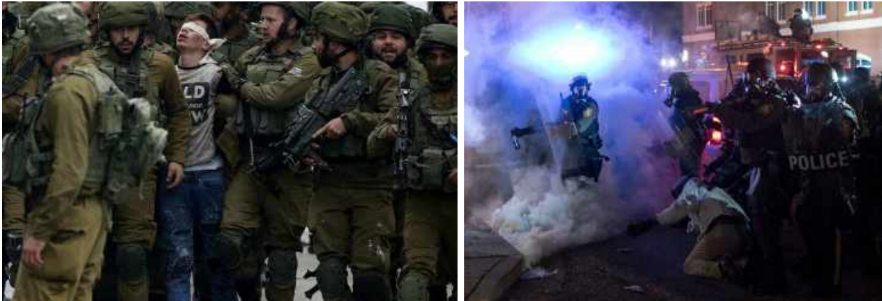
Law enforcement action in Israel (left) and in America (right).