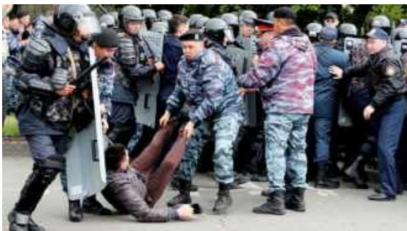
Kazakhstan riot police attacking peaceful protestors