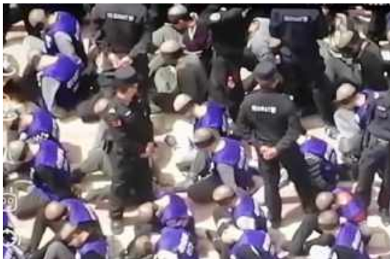
Hundreds of blindfolded prisoners in Xinjiang, western China.

Since 2010, the Hungarian government has been led by a far-right political party that promotes anti-Semitism and xenophobia. [21] Officials “are increasingly hostile to journalists and critics, and engage in anti-migrant, anti-Muslim and xenophobic rhetoric including through publicly funded campaigns.” [22]